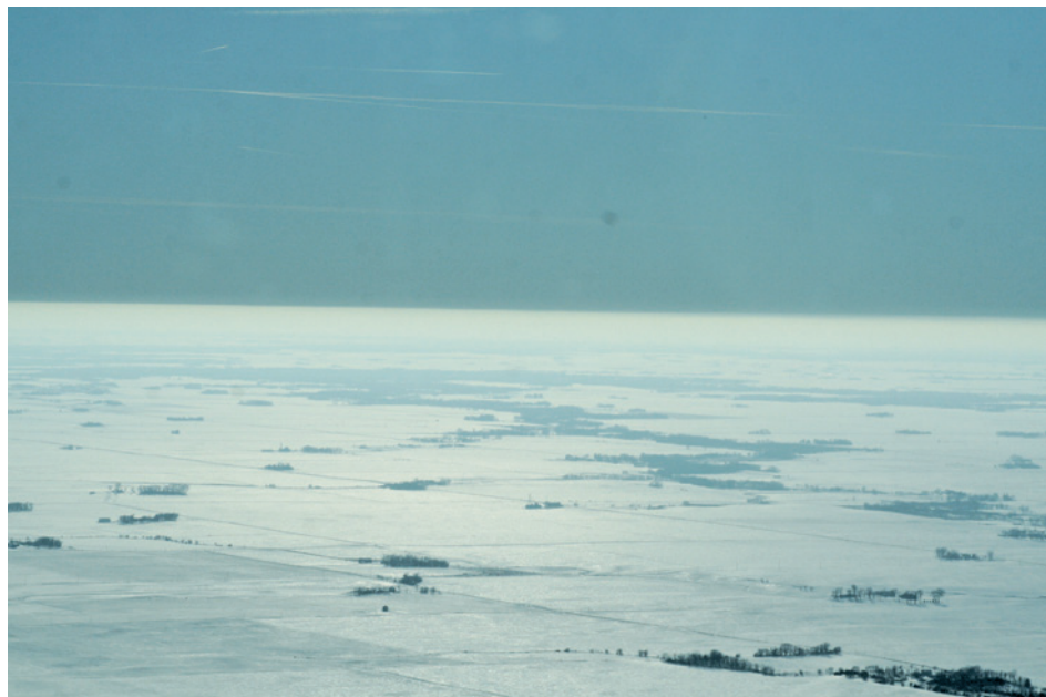
This is not the north pole. It is how the countryside outside of Clarion looks after our bouts with snow.

Bruce Voigts, Aerial Photographer (Photos taken December 15, 2025)