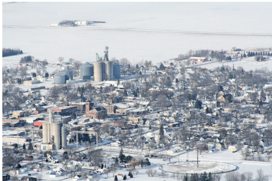
Clarion in winter snow cover.