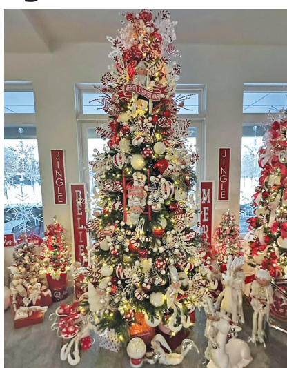
Callie Stein of Belmond proves that when it comes to holiday cheer, there’s no such thing as “too much,” proudly showcasing her five beautifully decorated Christmas trees.