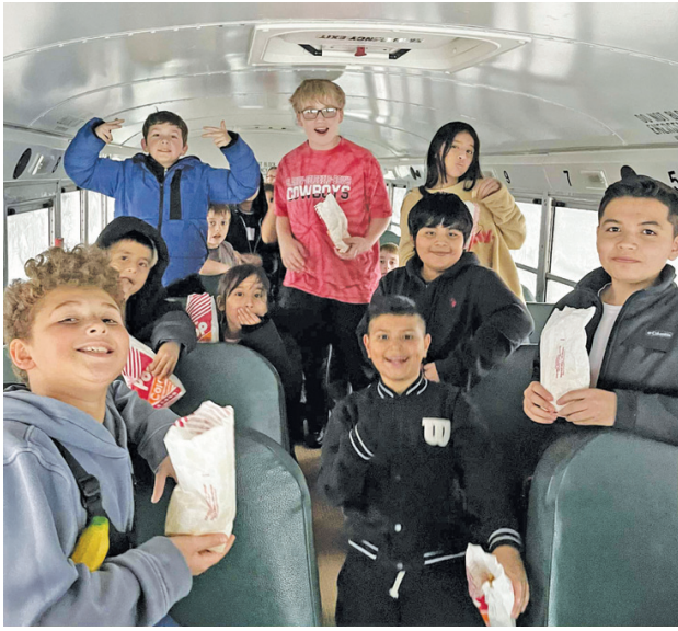
CGD students who were stopped to wait out sudden snow squalls west of Clarion were treated to Urness popcorn during their wait.

no trip to Urness is complete without a bag of popcorn. Each child was treated before heading back out to the warm bus. Given