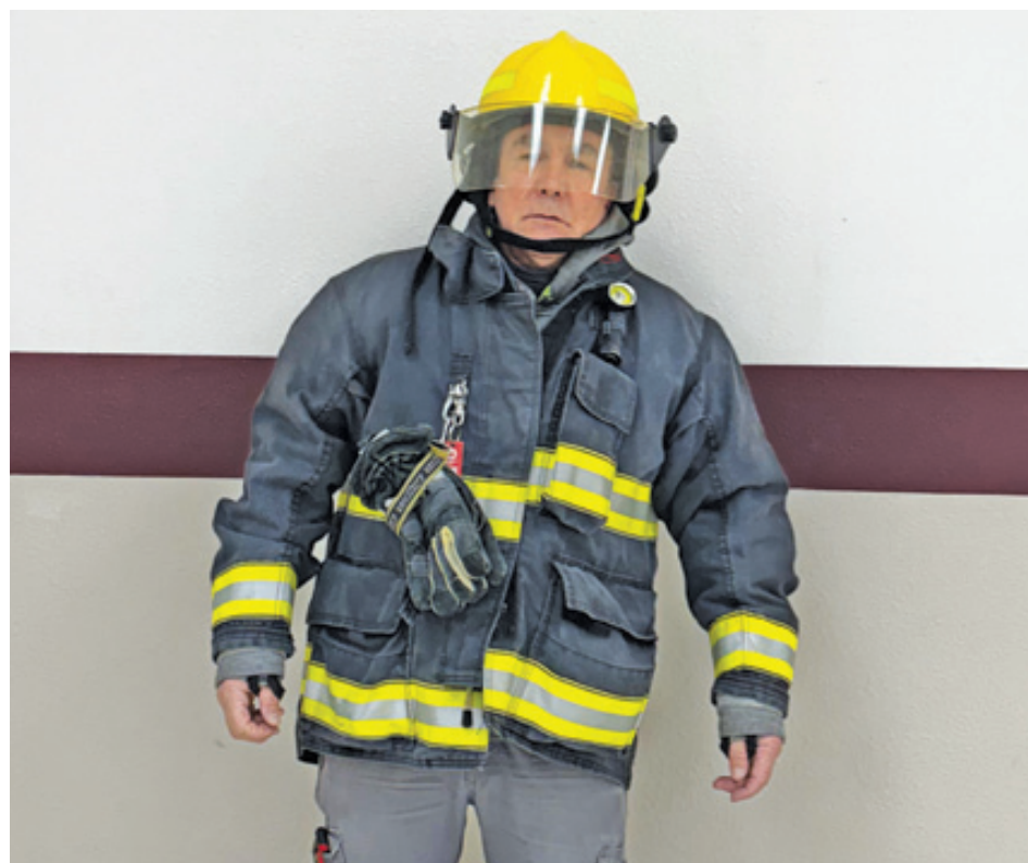
The Dows Fire Department was able to get new Bunker Gear because of the Wright County Charitable Grant. Thank you!