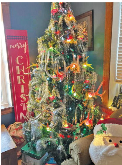
Tessa Yackle’s Christmas tree features a vintage-inspired look, complete with loose tinsel, deer antlers, and unique lighting. The Yackles recently opened their home for the Clarion Tour of Homes.