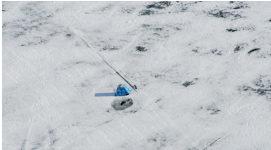
A blue colored shelter on Lake Cornelia for ice fishing. No vehicles on the Lake ice yet.