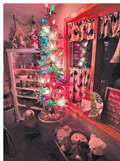
Sometimes, all it takes is a few twinkling lights to make a space feel warm and cozy on an Iowa winter night. This is one of two Christmas trees Tamara Beisel of Clarion shared with The Monitor.