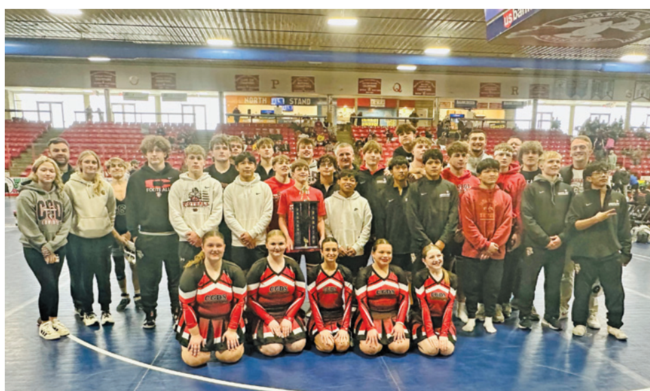
The Cowboys pose with some more new hardware.

"We put a stamp on who should be #1 in the state this weekend," Coach Yoder remarked in closing.