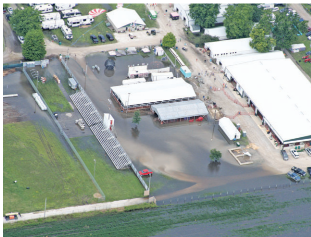
7-12-25 Wet Wright County Fairgrounds in Eagle Grove.