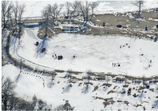
2-23-25 Quiet water area at Lake Cornelia.