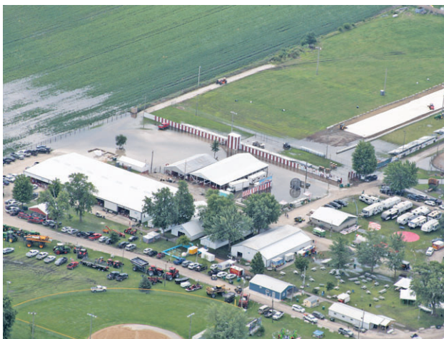
7-12-25 Wet Wright County Fairgrounds in Eagle Grove.