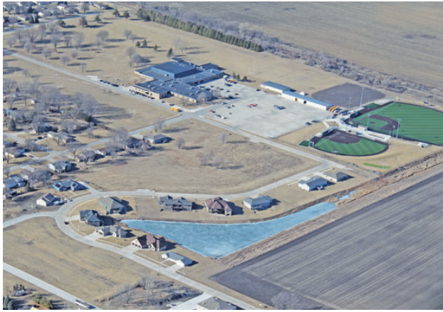
1-29-25 CGD School and White Fox Landing no snow in January.

Bruce Voigts, Aerial Photographer (Photos taken January - December, 2025)