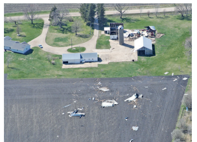
4-21-25 Storm damage from building parts blown into field.