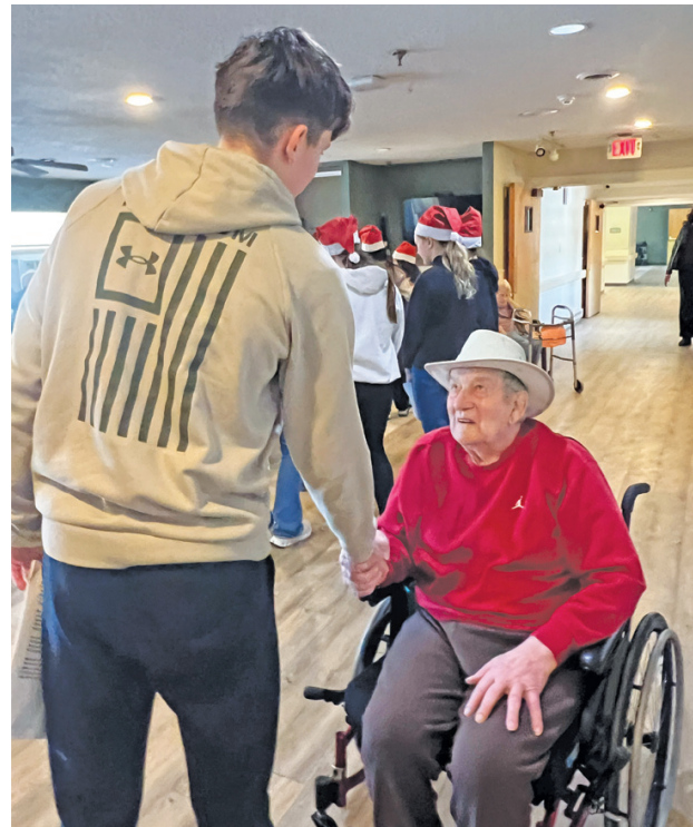
Community outreach teaches students how to connect to the world around them.