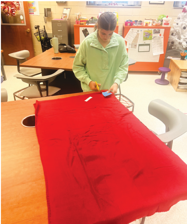
A student is photographed while creating a lap blanket to donate to the Clarion Care Center.

Through small acts of kindness like these, students learn that making a difference doesn’t have to be grand; it just has to come from the heart.