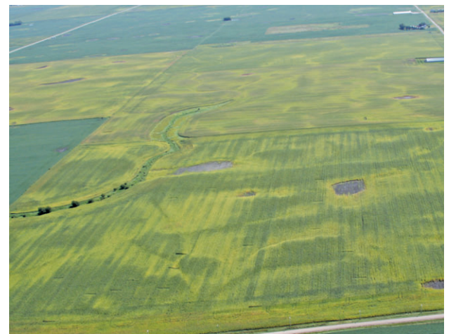
8-26-25 Farm fields starting to mature and maybe some nitrogen shortage from excess rain.