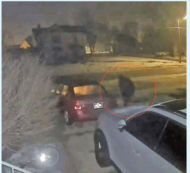
Screenshot from a Clarion resident’s security camera showing an individual near a vehicle during the early morning hours of December 23.