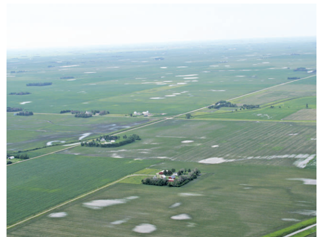
6-26-25 Excess rain with farm fields ponding water.