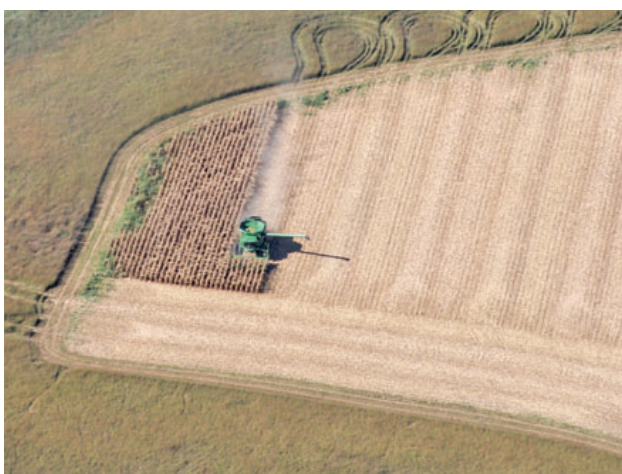
9-7-25 Starting fall harvest.