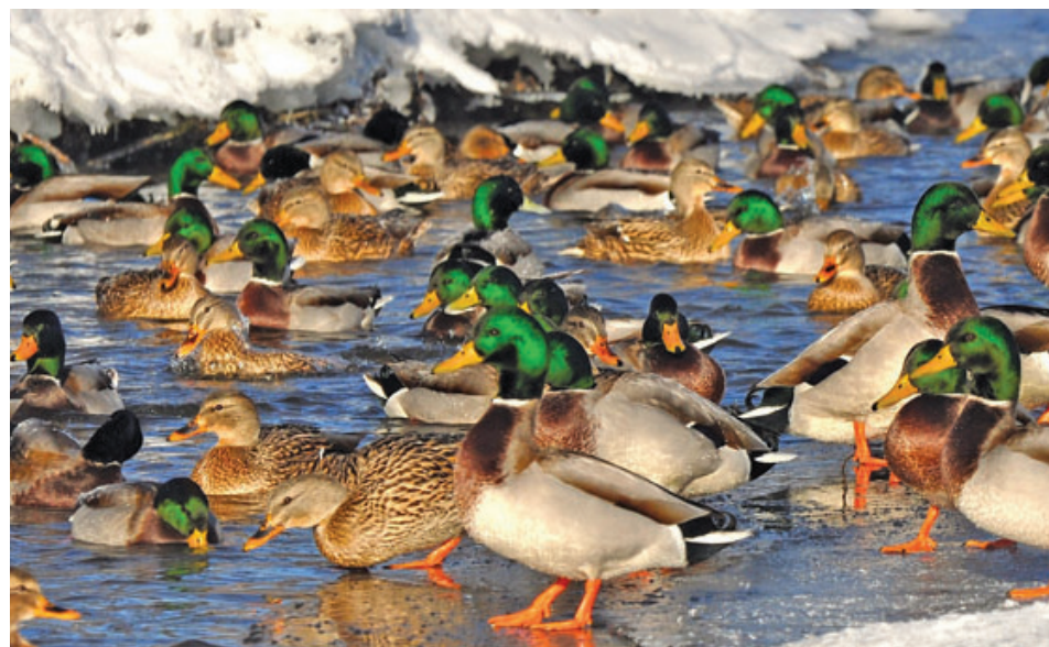
Wintering Mallard Ducks – Dabbling ducks, such as mallards, may harbor avian influenza viruses but remain healthy while distributing the virus to new areas and new populations.

conducted at the University of Minnesota’s Raptor Center revealed that more than 50 percent of the eagles examined had specific neutralizing antibodies for avian influenza. Other raptors appear to lack such immunity.