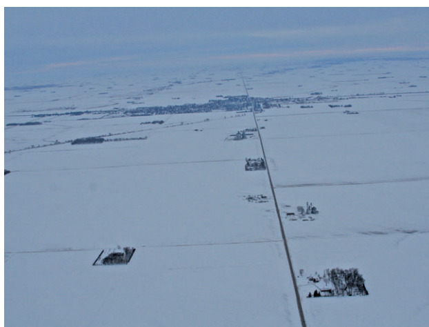
12-2-25 Clarion area after early 12+” of snow.