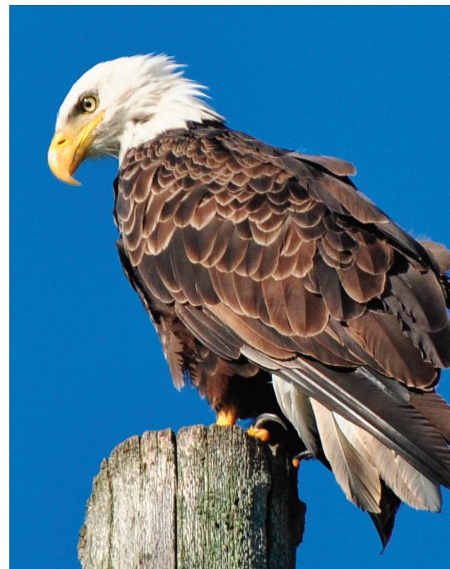
Wintering Bald Eagle – Although wintering bald eagles are actively scavenging on infected goose carcasses, many – especially adult birds – have effective antibody immunity.

Learn more about Iowa wildlife online at Washburn’s Outdoor Journal at iawildlife.org/blog