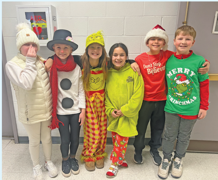
Students pose for a photograph dressed as their favorite Christmas movie or character.

The High School Student Council planned Holiday dress up days for the entire district for the last few days before Holiday break.