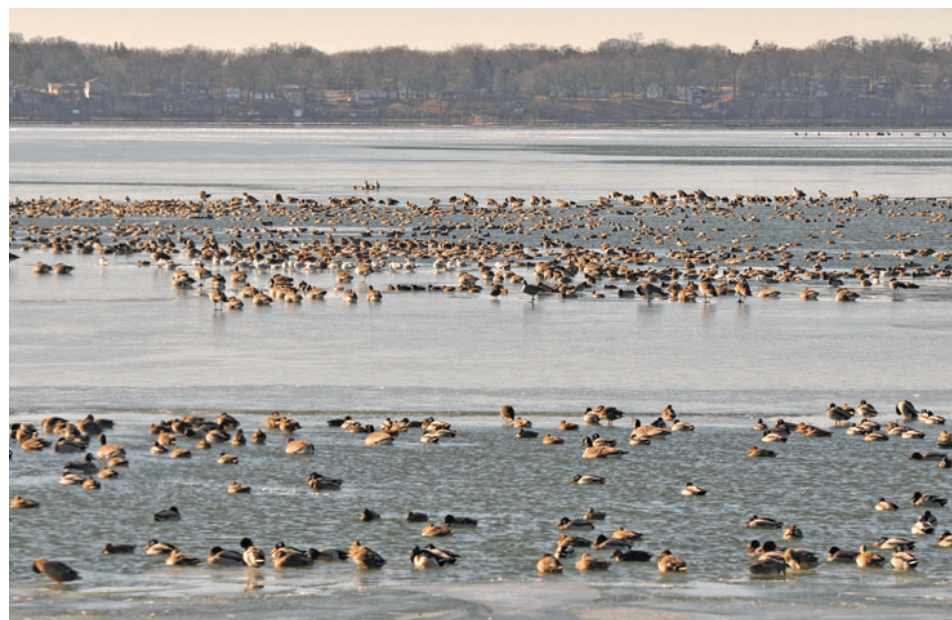
Winter Airhole -- As wintering ducks and geese concentrate into shrinking areas of open water; the escalating effects of the deadly flu virus takes its toll. Reports of dead or dying birds are currently on the increase across western and northern Iowa, according to State Wildlife Veterinarian, Dr. Rachael Ruden.

Young-of-the-year eagles appear to be most susceptible to the virus. By contrast, many mature bald eagles have antibodies against the virus based on birds that have been tested after dying of unrelated causes, said Ruden. A recent (2023) study