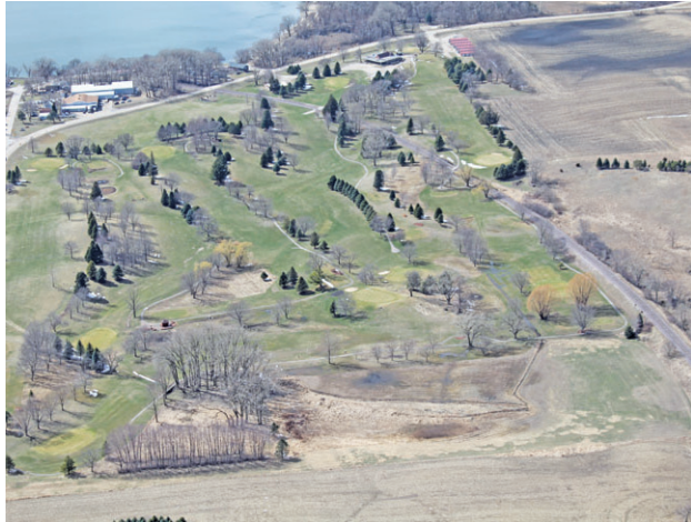
3-31-25 Clarmond green grass.