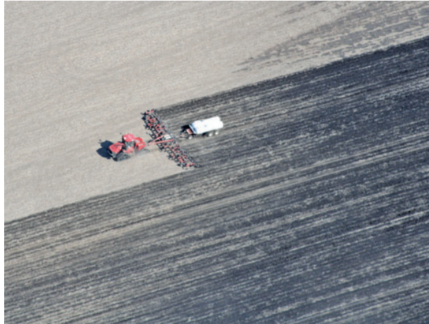
4-8-25 Starting field work with anhydrous application.