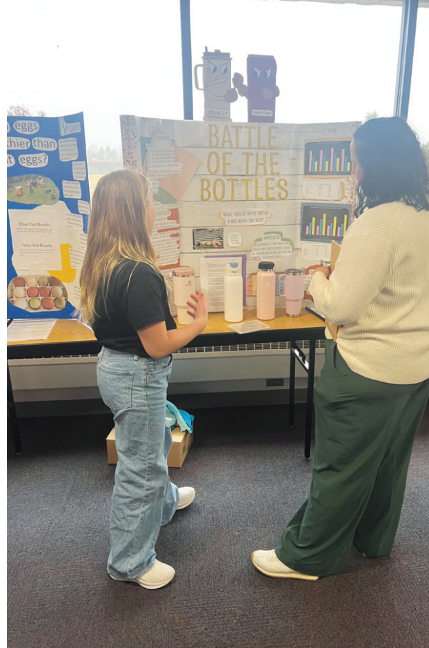
“Battle of the Bottles” was the title of one CGD student’s Science Fair project. They asked and answered, “What Popular Water Bottle Brand Works the Best?”