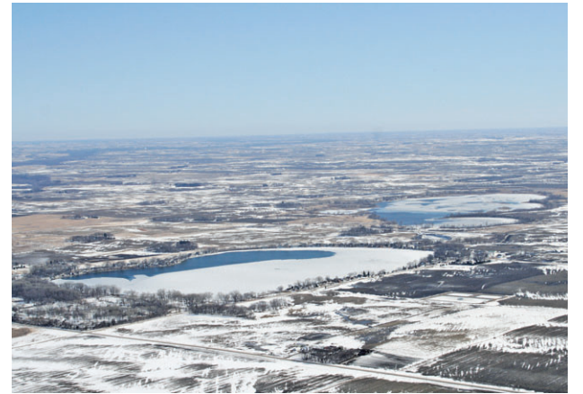
3-8-25 Ice breaking at Lake Cornelia and Elm Lake.