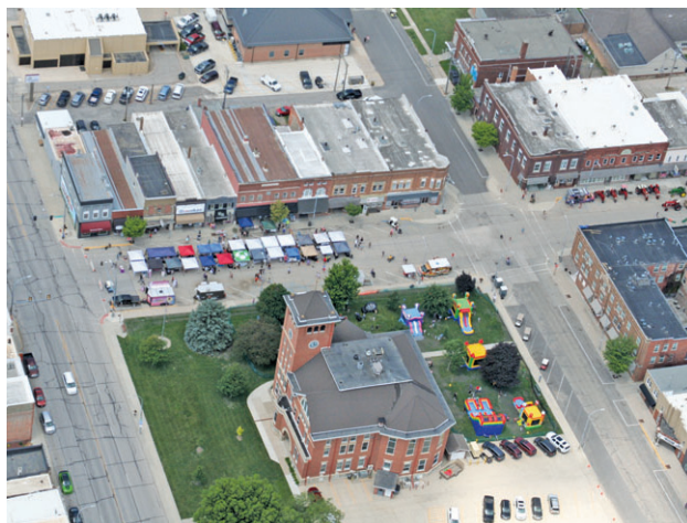
6-14-25 Festival in the Park