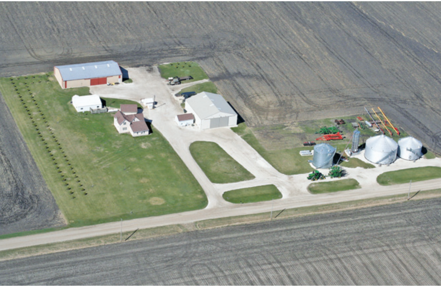
Tractor and tillage implement by the grain bins on right of picture.