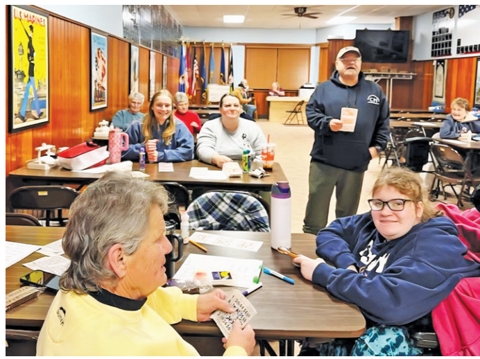
Another successful Bingo this past week at the Dows American Legion. There was plenty of good food, pops and most importantly fun. Thank you all for coming. Join us this Friday April 17!