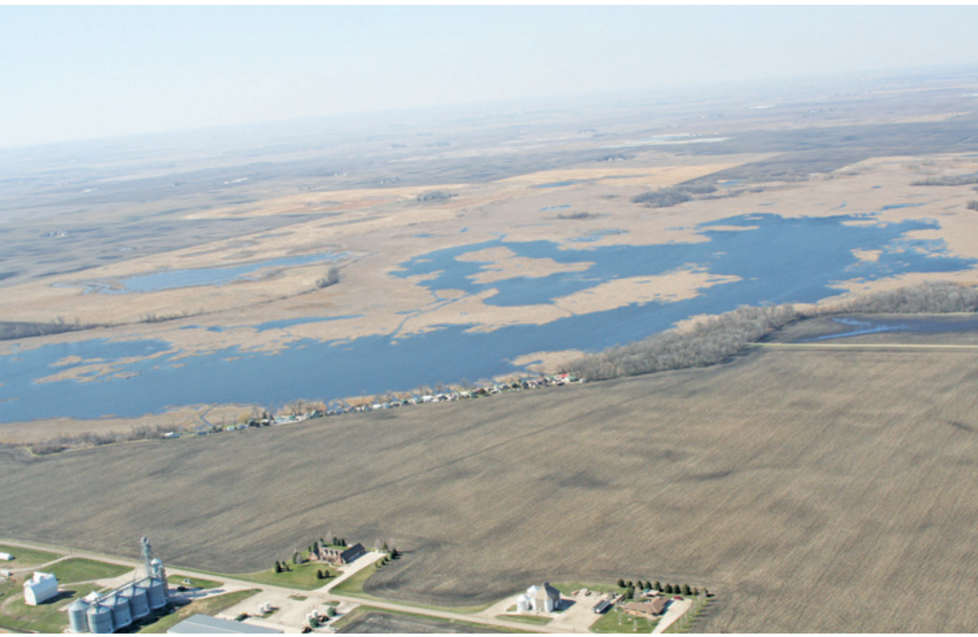
Big Wall Lake with water level increased from winter due to recent rains. There are not much drought areas in Iowa at this time.

(Photos taken April 10, 2026)