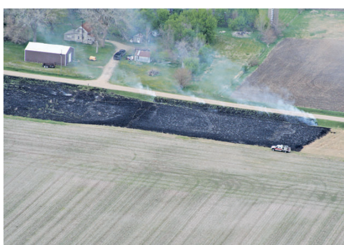
Conservation Reserve Program (CRP) grasslands and established prairies continue to be burned in the Clarion area. This day had over 3 areas north of Clarion having burning going on. The burning is mimicking the natural processes to invigorate the beneficial grasses and hinder weeds and trees from getting established.