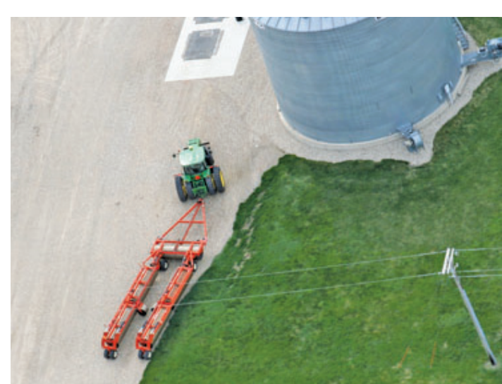
A red roller just north of Clarion hooked up to the tractor that can be pulled over recently planted soybean acres. One benefit of land rolling is to prepare the field for fall harvesting by pushing small and medium-sized rocks down into the soil and crushing soil clods and corn root balls. This allows the combine head to be set low to the ground, reducing the risk of picking up damaging rocks, root balls and soil.