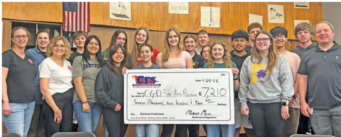
The Fine Arts Booster raised a little over 7 thousand dollars for CGD's students.