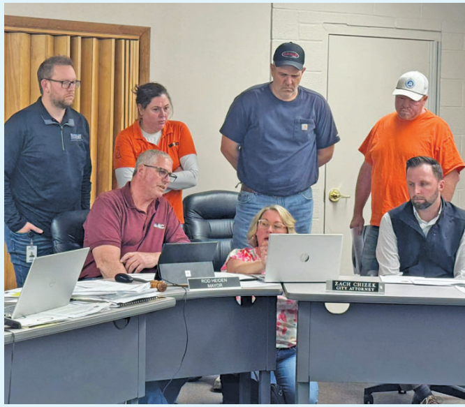
Ring presented a sample layout of a 1,200-square-foot home. The proposed design includes two bedrooms, one bathroom, and a single-stall garage. Ring emphasized that while this would slightly lower projected valuations on paper, the current reality is that those lots are not generating tax revenue right now.