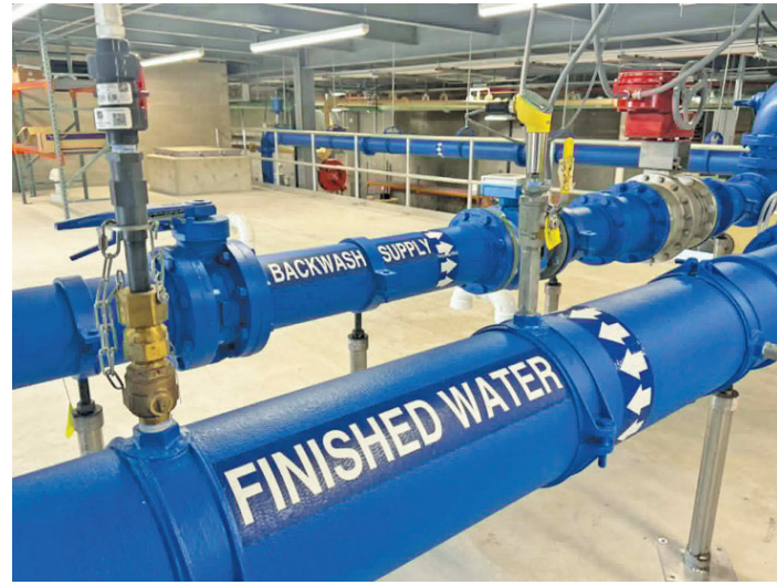
Water lines labeled "finished water" and "backwash supply" show part of the new treatment system, which significantly reduces water waste compared to the city's previous plant.

For residents, the benefits are a simple improvement to everyday life: better-tasting water, less buildup on appliances and pipes, and fewer worries about what is coming out of the tap.