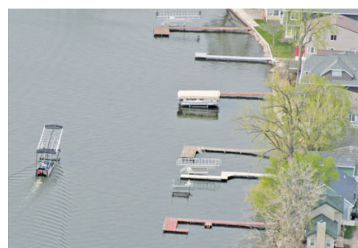
A spring "ritual" at Lake Cornelia is putting the boat lifts back in their previous places after the ice has gone off the lake.