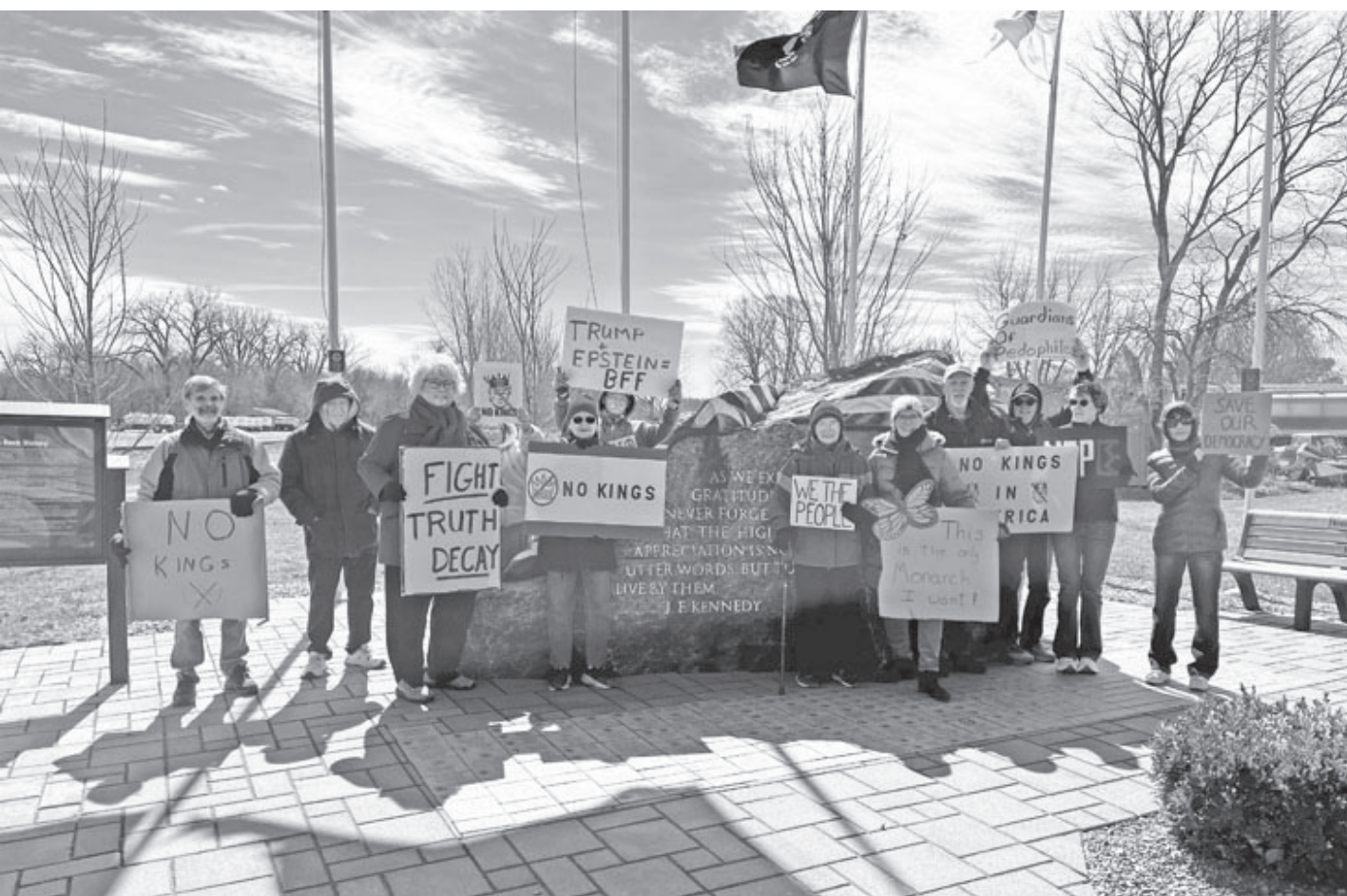
Protestors stand around the Dows Freedom Rock on March 28 at the Dow's "No Kings" rally.