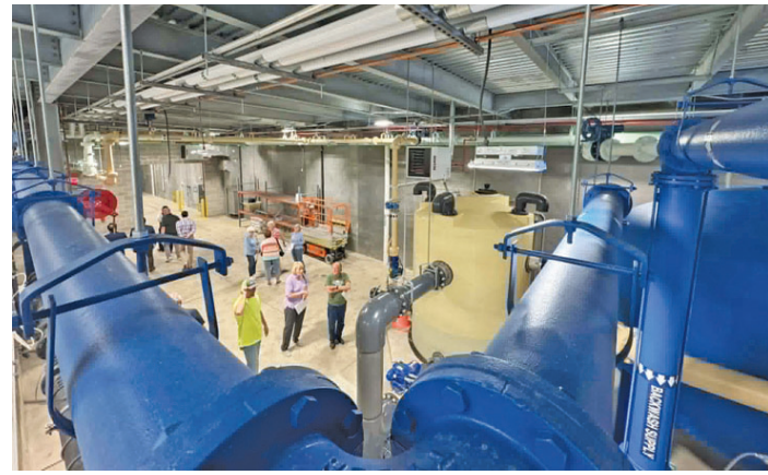
Community members tour Clarion's new water treatment plant during a recent open house, learning how the upgraded system improves water quality and efficiency.