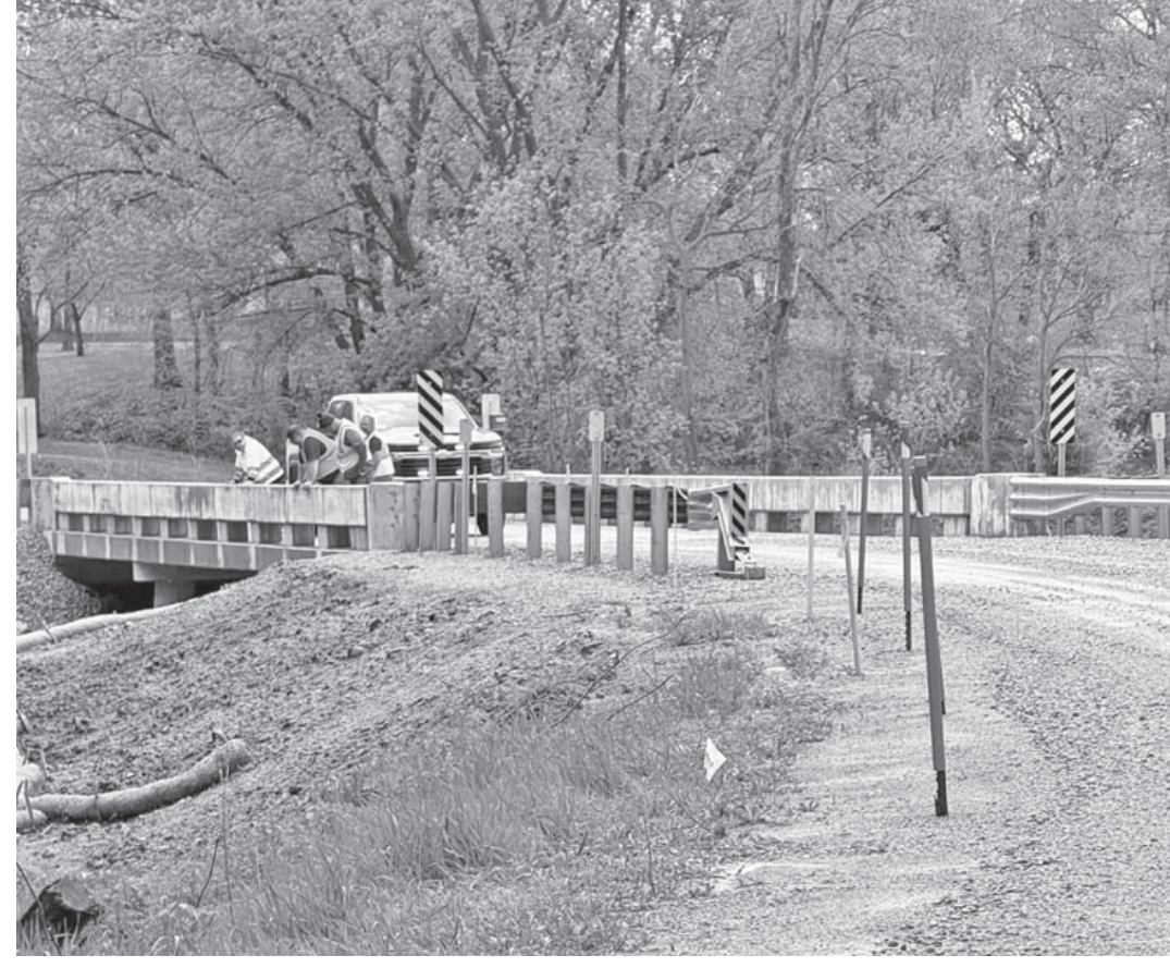
Residents close to the Taylor Ave bridge have raised concerns about the guardrail, combined with the curve approaching the bridge creates a tight passage for cars. Supervisors agreed to remove the guardrail and extend the area out with concrete. Article on page 1.